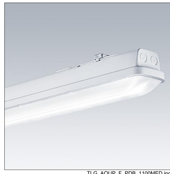
TLG AQUP F PDB 1100MED.jpg

All values marked with an * are rated values. Thorn uses tried and tested components from leading suppliers, however there may be isolated instances of technology-related failures of individual LEDs during the rated product lifetime. International standards set the tolerance in initial flux and connected load at ±10%. Unless stated otherwise, the values apply to an ambient temperature of 25°C.