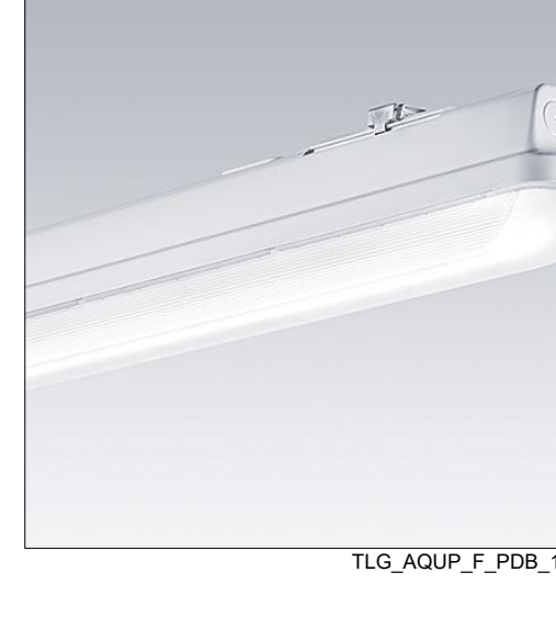
TLG AQUP F PDB 1600WD.jpg