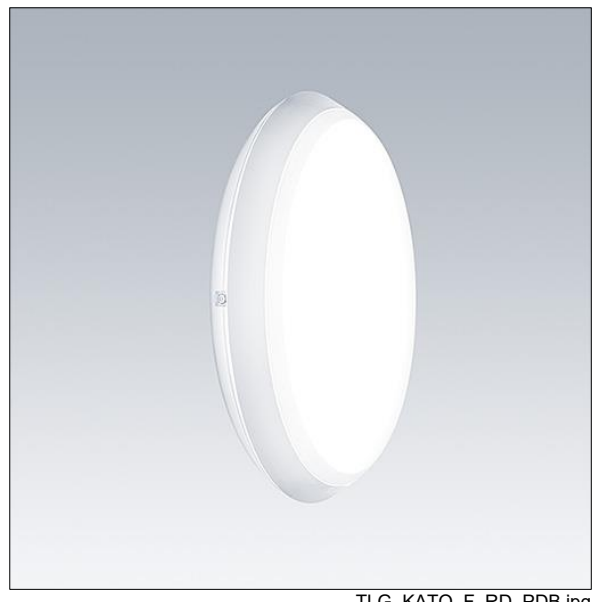
TLG KATO F RD PDB.jpg