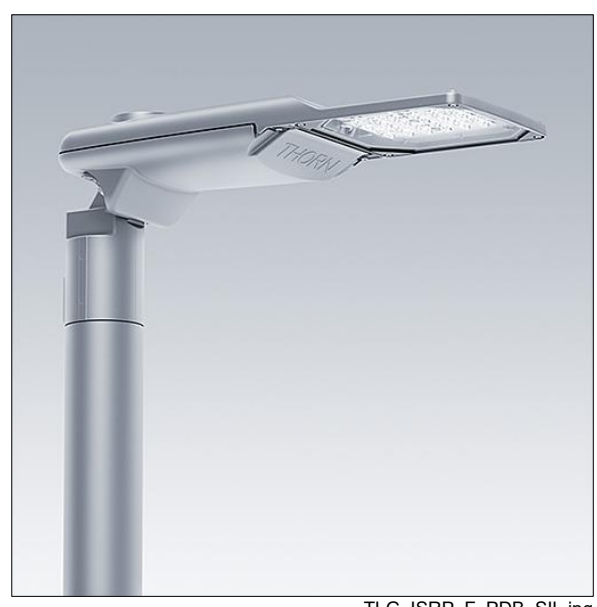
TLG ISRP F PDB SIL.jpg