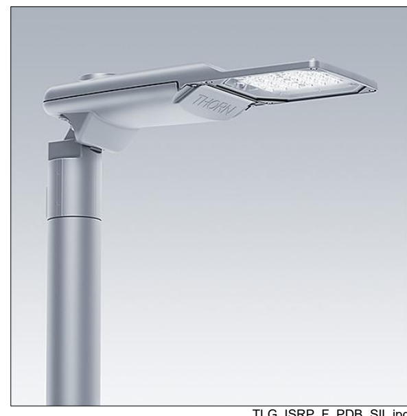
TLG ISRP F PDB SIL.jpg