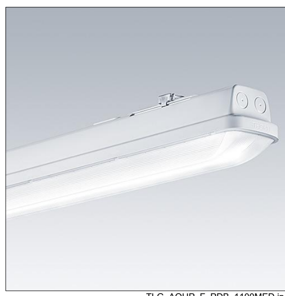
TLG AQUP F PDB 1100MED.jpg