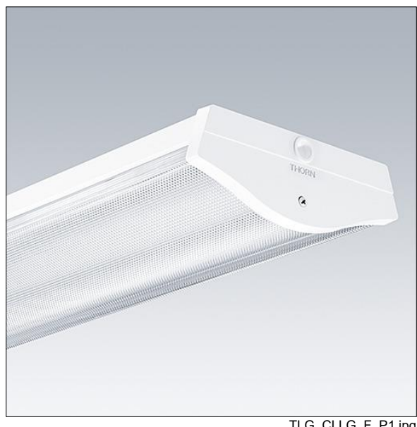
TLG CLLG F P1.jpg