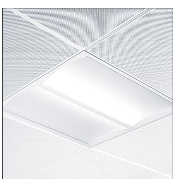
TLG IQWV F PDBCEILING.jpg

Dimensions: 597 x 597 x 97 mm Luminaire input power: 40 W Luminaire luminous flux: 4050 lm Luminaire efficacy: 101 lm/W Weight: 3.9 kg