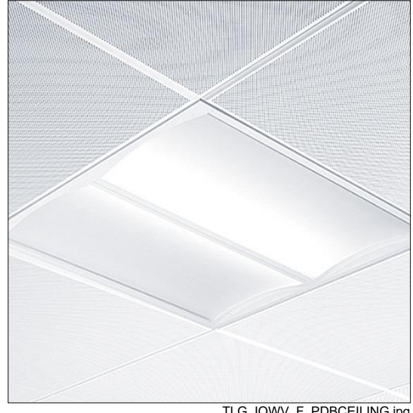
TLG IQWV F PDBCEILING.jpg