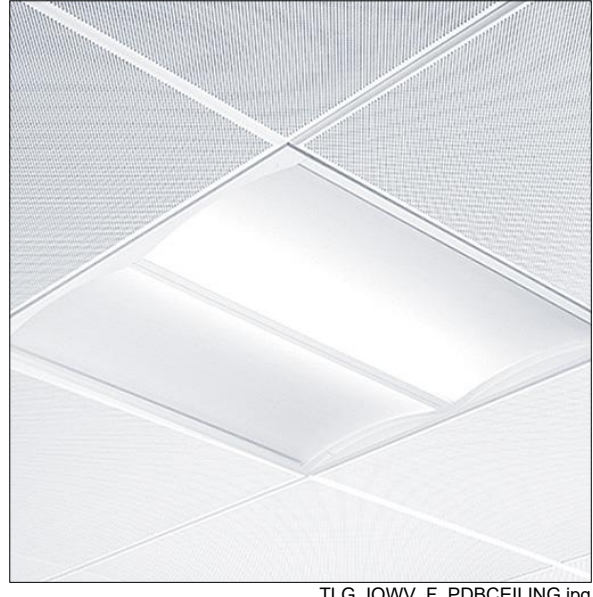
TLG IQWV F PDBCEILING.jpg