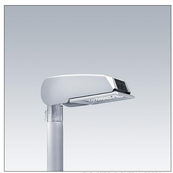
TLG CTEQ F SMTP36LEDPDB.jpg