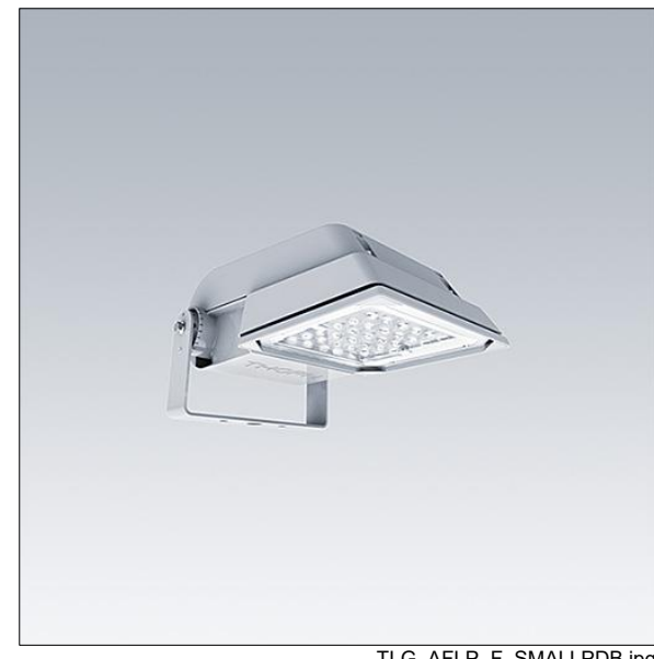
TLG AFLP F SMALLPDB.jpg