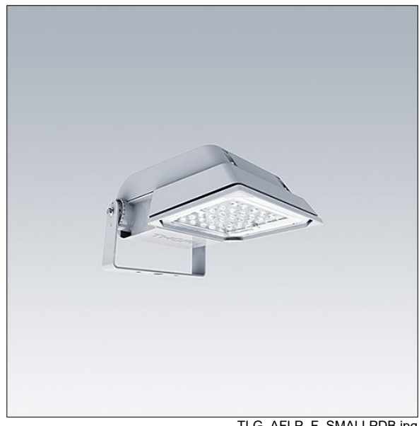
TLG AFLP F SMALLPDB.jpg