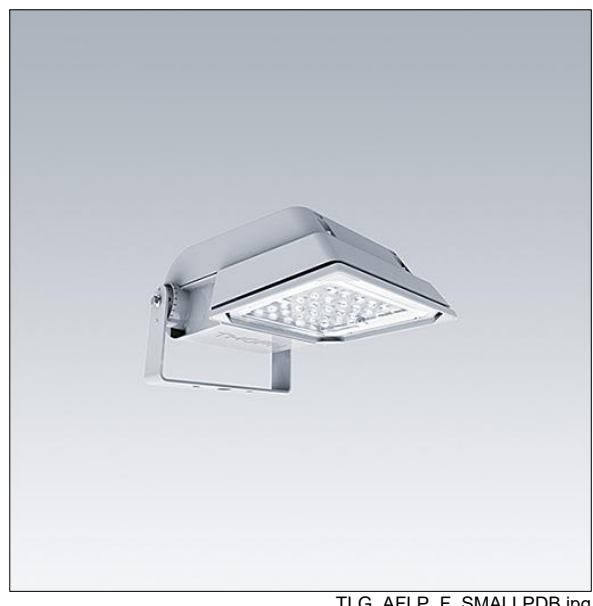
TLG AFLP F SMALLPDB.jpg