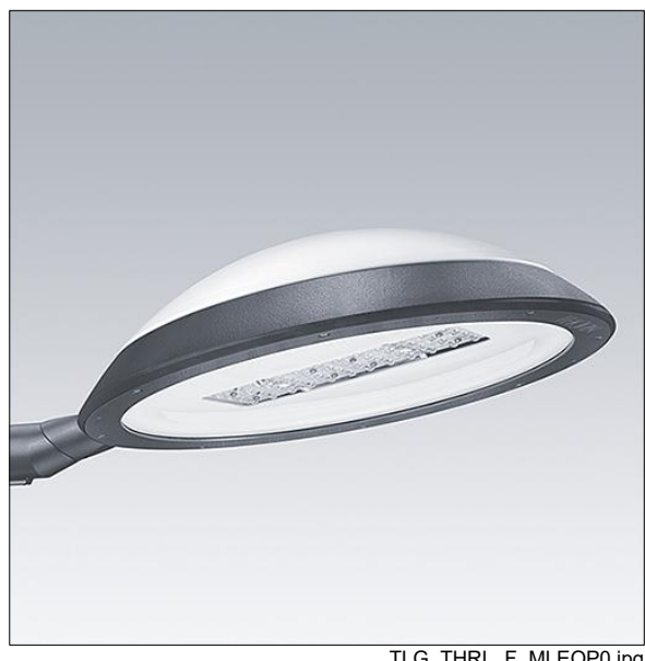
TLG THRL F MLEOP0.jpg

Weight: 14.2 kg Scx: 0.044 m<sup>2</sup>