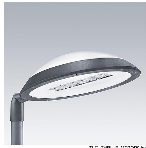
TLG THRL F MTPOP0.jpg

Weight: 14.6 kg Scx: 0.044 m<sup>2</sup>