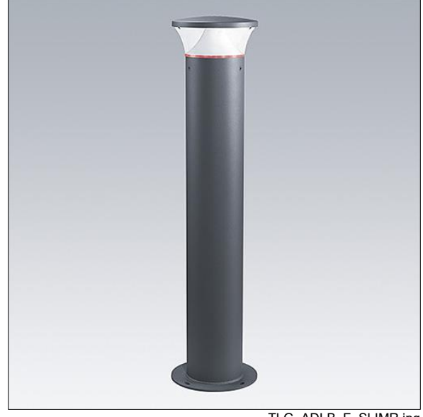
TLG ADLB F SLIMR.jpg