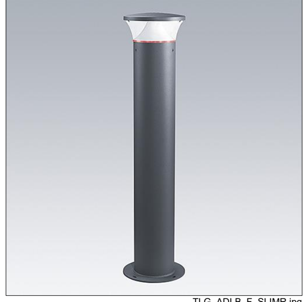
TLG ADLB F SLIMR.jpg