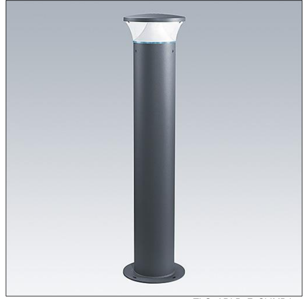
TLG ADLB F SLIMB.jpg