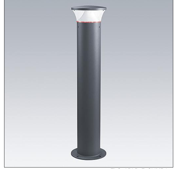
TLG ADLB F SLIMR.jpg