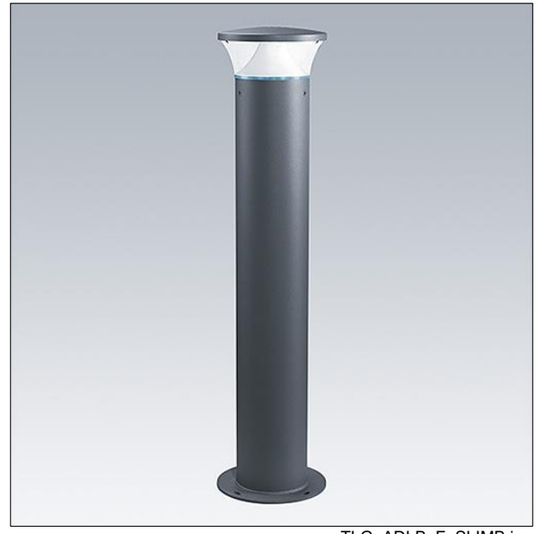
TLG ADLB F SLIMB.jpg