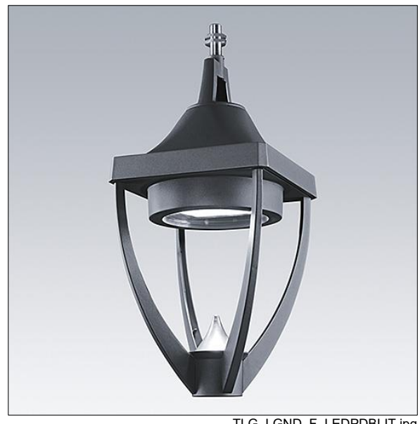
TLG LGND F LEDPDBLIT.jpg

Weight: 16.5 kg Scx: 0.14 m<sup>2</sup> Scx: 0.14 m<sup>2</sup>