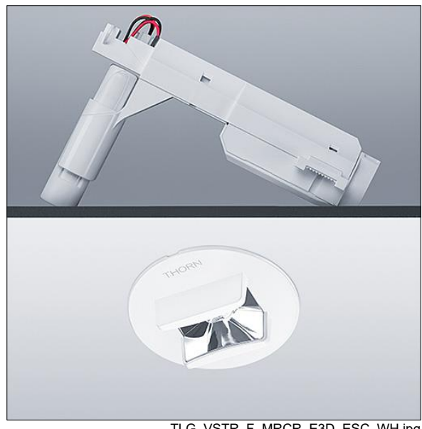
TLG VSTR F MRCR E3D ESC WH.jpg