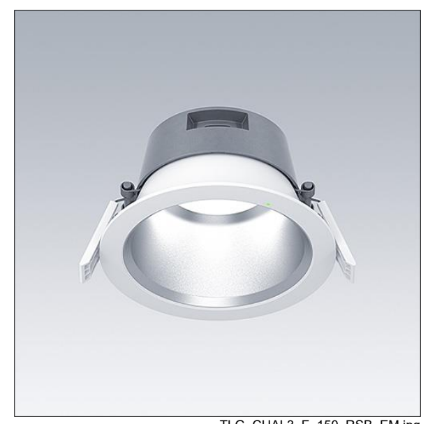
TLG CHAL3 F 150 RSB EM.jpg