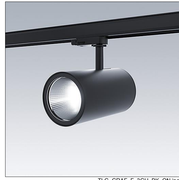
TLG GRAF F 3GU BK ON.jpg