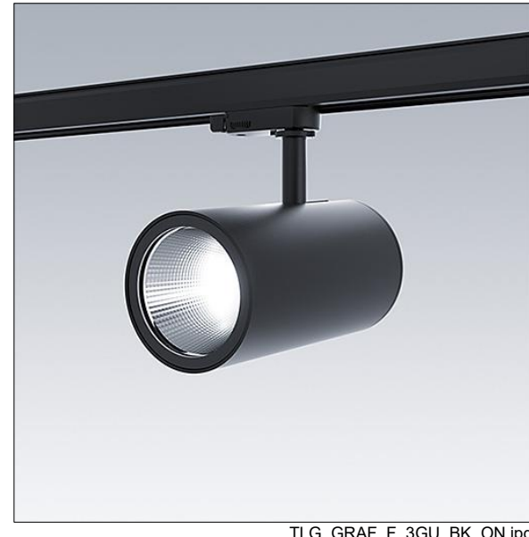
TLG GRAF F 3GU BK ON.jpg