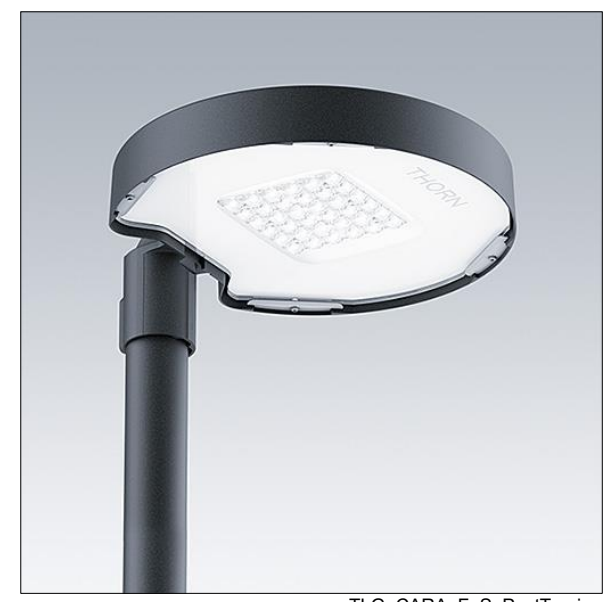
TLG CARA F S PostTop.jpg