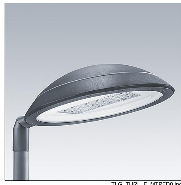
TLG THRL F MTPFD0.jpg

Weight: 13.9 kg Scx: 0.044 m<sup>2</sup>