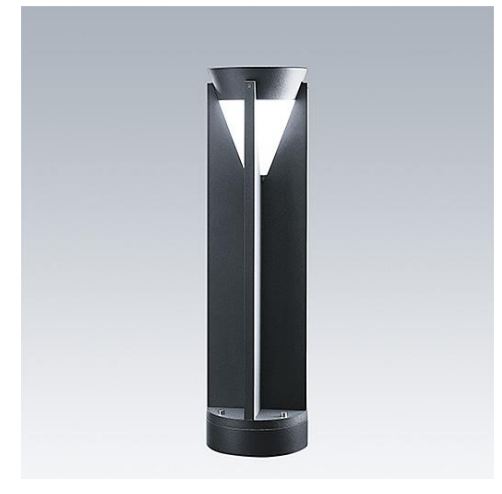
Photographs, line drawings and photometric data are representative only. For specific product detail please select an individual product.