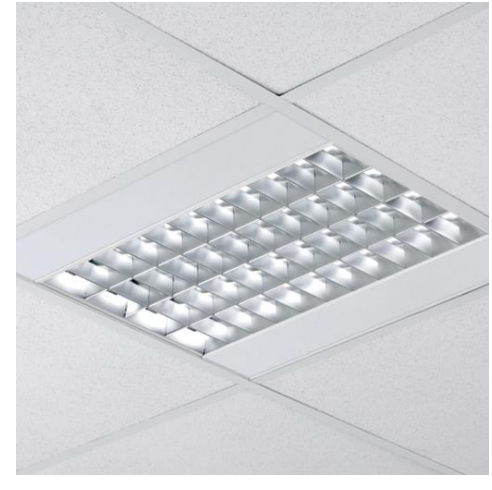
Photographs, line drawings and photometric data are representative only. For specific product detail please select an individual product.