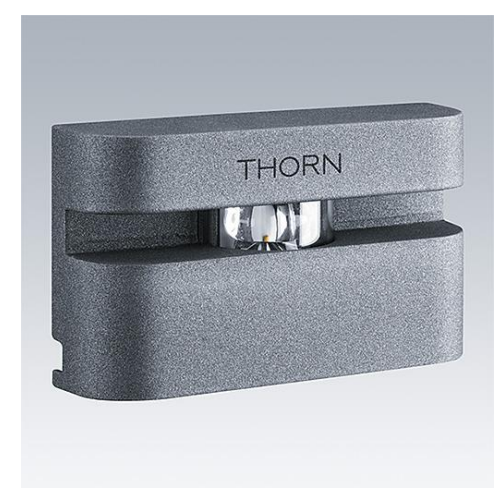
Photographs, line drawings and photometric data are representative only. For specific product detail please select an individual product.