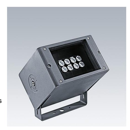
Photographs, line drawings and photometric data are representative only. For specific product detail please select an individual product.